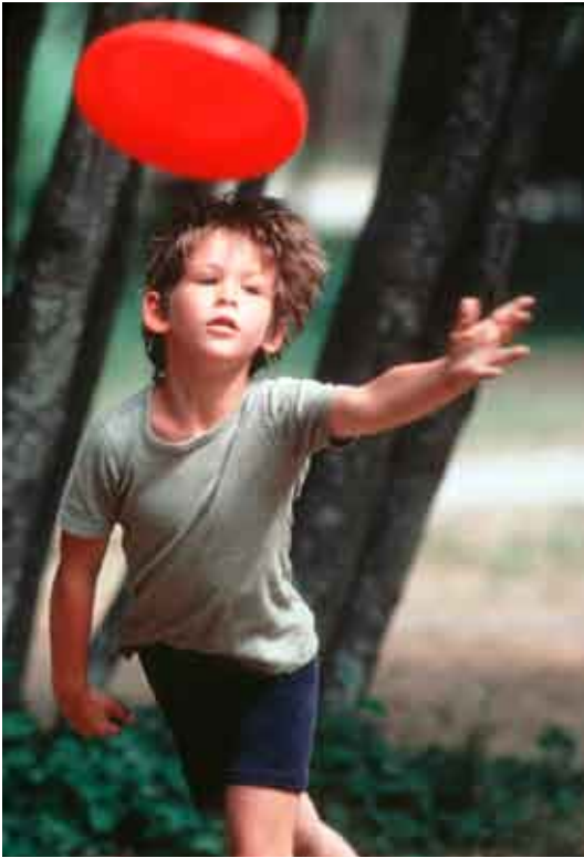
Disc golf Frisbees are smaller and thicker.

Nowadays you can buy a lot of different Frisbees.